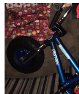
Boys Foam Rocker Bike

However, we have recently had two items go missing and not be returned.